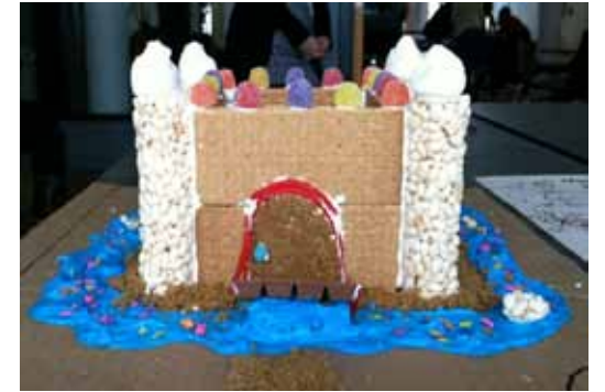
Third Place: Team 4 with "Castle" a remarkably accurate food-created castle complete with structurally sound walls, a moat complete with fish, and a drawbridge. Notice the Bush in the back!