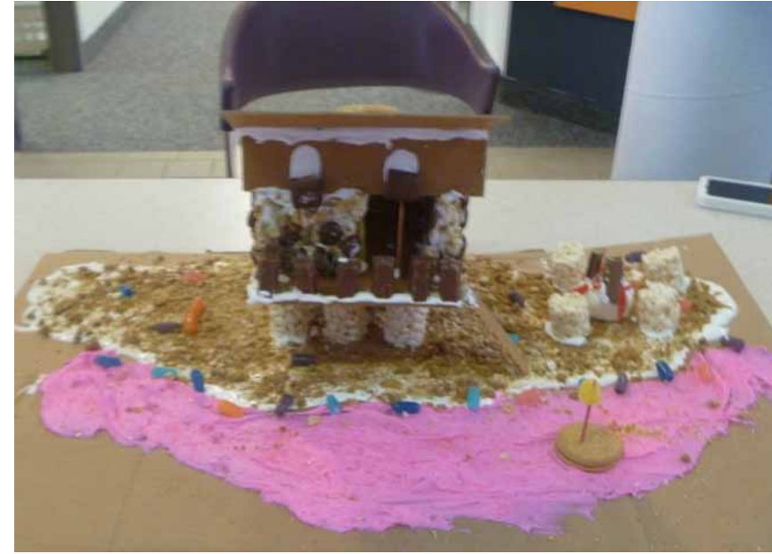
First Place: Team 2 with "Beach House with Pink Water" Inspired by the yearning for warmer weather and structures from Frank Lloyd Wright. Notice the detailed Milk-Dud stone facade, Kit-Kat fire pit, and the S.S.Gum Drop boat.