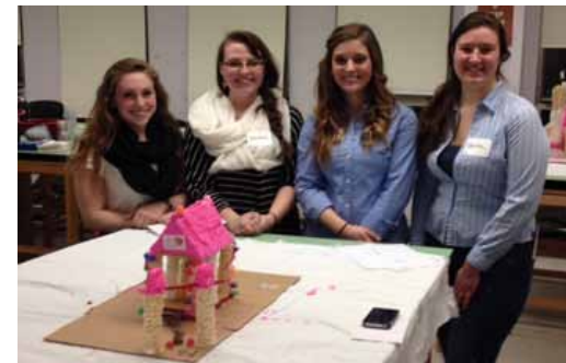
Team 2: Team 2 was inspired by the parthenon, building to be structurally sound they even have their ASID "flag" hung proudly.