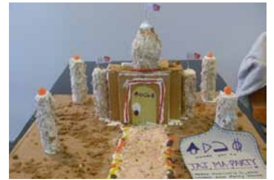
Second Place: Team 1 with "Taj Ma Party" Inspired by the Famous Taj Mahal this is an ASID Party House complete with an invitation "Bring your drafting tools and your party pants!"