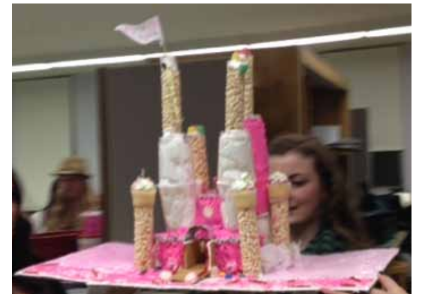
First Place: Team 6 used their materials to their full potential. Coming in first place for their creative use of all of their materials and their enthusiasm for their pink mansion.