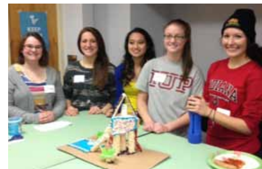
Team 1: Team 1 was inspired by the log like rice crispy treat and designed a treehouse. Thinking about warmer weather, they even included a slide complete with a floatation device of licorice.