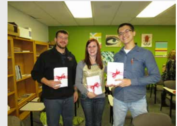
Mercyhurst Raffle Winners