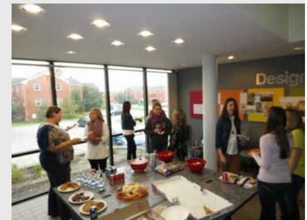
Students at Mercyhurst enjoying pizza & cookies