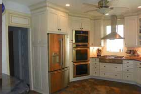
Private Residence by Pat Good of Multi Dimensional Designing Services, Inc