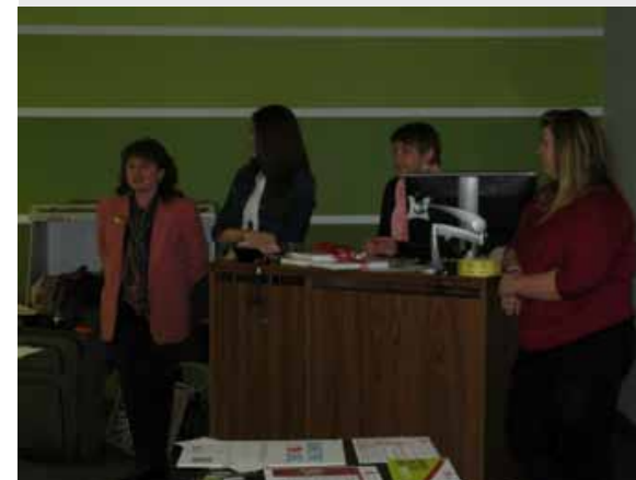
Professionals speaking to students at Mercyhurst