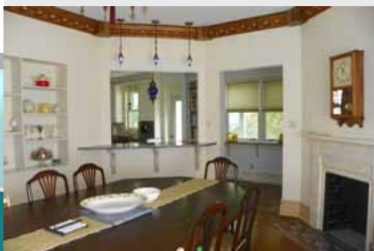
Private Residence by Pat Good of Multi Dimensional Designing Services, Inc